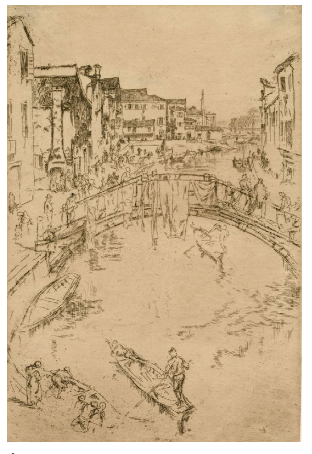
James McNeill Whistler, The Bridge , c1879–1880, etching on laid paper.