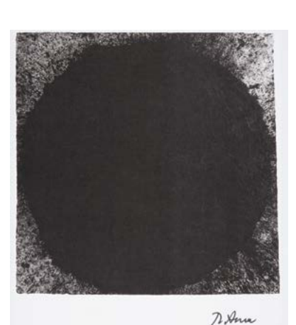
Richard Serra (United States, born 1939) Out-of-round X, 1999, printed 2008 Duotone with paint on heavy Tintoretto gesso on paper 25 1/2 x 23 1/8 in Gift of Donald J. Mrozek and R. Scott Dorman 2015.99