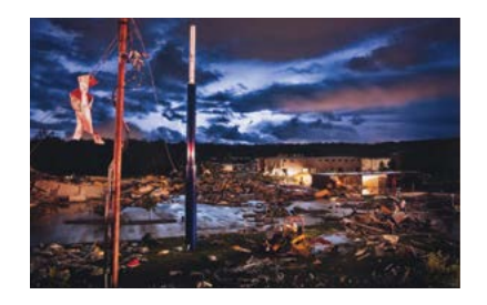
Luke Townsend F4, 2008 Inkjet print on paper 15 7/8 x 23 7/8 in Gift of the artist 2015.17