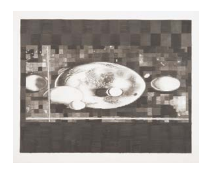
Jonah Criswell No Precipitation, 2013 Graphite on paper 22 7/8 x 28 15/16 in Gift of the artist 2015.16