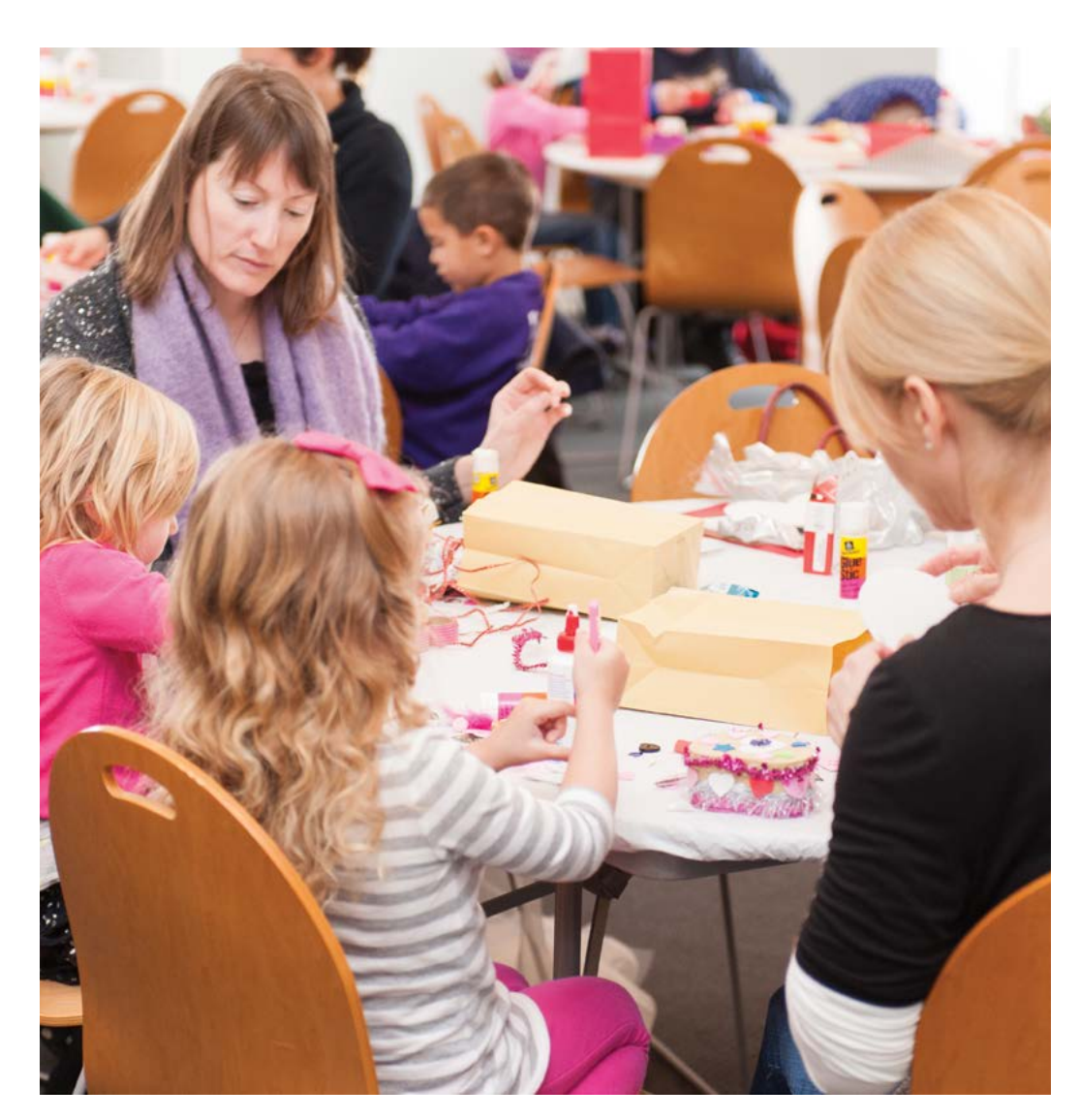
Children and parents participate in a Valentine's Day Workshop

In 2014-2015, 2,048 people attended 39 public programs, an increase of more than 800 in program attendance from 2013-2014. The most popular programs were In Conversation: Dawoud Bey and