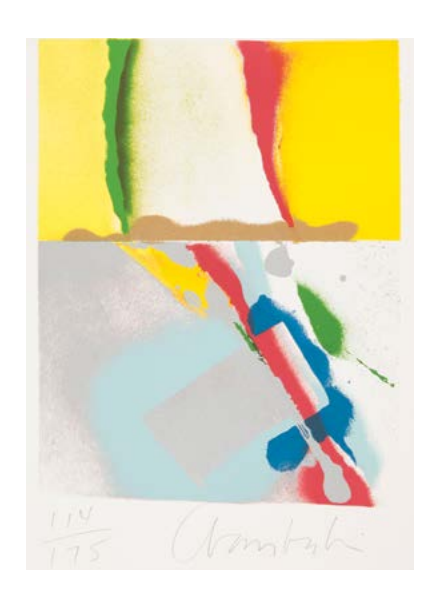
John Chamberlain (United States, 1927 – 2011) Flashback III, 1981 Lithograph on paper 19 x 14 1/2 in Gift of Donald J. Mrozek and R. Scott Dorman 2015.38

Christina Naranjo (United States, Santa Clara Pueblo, 1891 – 1980) Blackware Awanyu (water serpent) jar, 20th century Earthenware 5 7/8 x 5 7/8 in Gift of the Estate of Lolafaye Coyne 2015.58