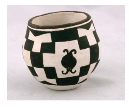
Corrine Chino (United States, Acoma Pueblo, born 1959) Jar, 20th century Earthenware with pigment 2 7/16 x 2 3/8 in Gift of the Estate of Lolafaye Coyne 2015.42