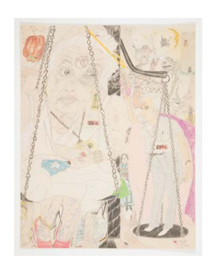
Elizabeth Layton (United States, 1910 – 1993) ERA, 1978 Colored pencil and graphite on paper 28 x 22 in Gift of the Lawrence Arts Center 2014.454

Jacqueline Bishop (United States, born 1955) Samauma, 1993 Screenprint on paper 21 1/8 x 14 3/8 in Gift of Joe and Barb Zanatta 2015.12