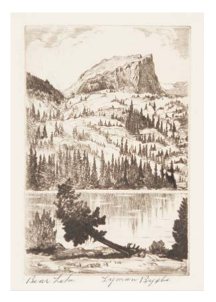
Lyman Byxbe (United States, 1886 – 1980) Bear Lake, ca. 1935 Etching on paper 4 5/8 x 3 1/8 in Gift of the Estate of Lolafaye Coyne 2015.28

Lucy M. Lewis (United States, Acoma Pueblo, 1898 – 1992) Feather pattern bowl, 20th century Earthenware with pigment 3 11/16 x 5 1/8 in Gift of the Estate of Lolafaye Coyne 2015.53 image on back cover