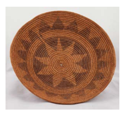
Undetermined Navajo wedding basket, 20th century Plant fiber 2 1/16 x 13 1/8 in Gift of the Estate of Lolafaye Coyne 2015.89

Charles Leroy Marshall Sr. (United States, 1905 – 1992) Title unknown (boy reading book), 1934 Ink and watercolor on paper 2 7/8 x 4 3/8 in Gift of Charles L. Marshall Jr. 2015.109